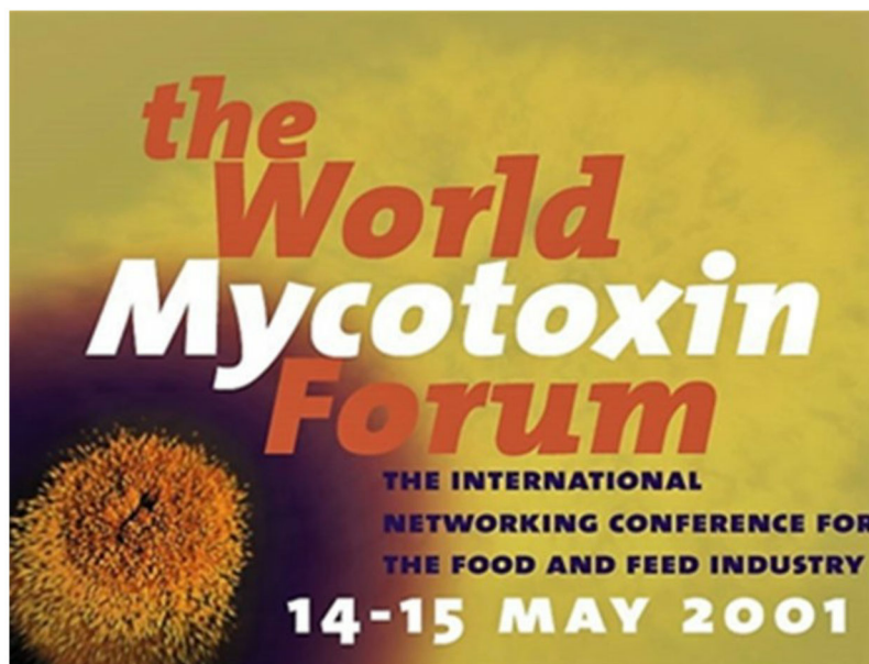
FIGURE 2 The announcement of the first World Mycotoxin Forum in Noordwijk, the Netherlands, 2001.